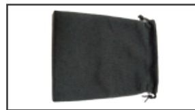
Includes Travel Bag